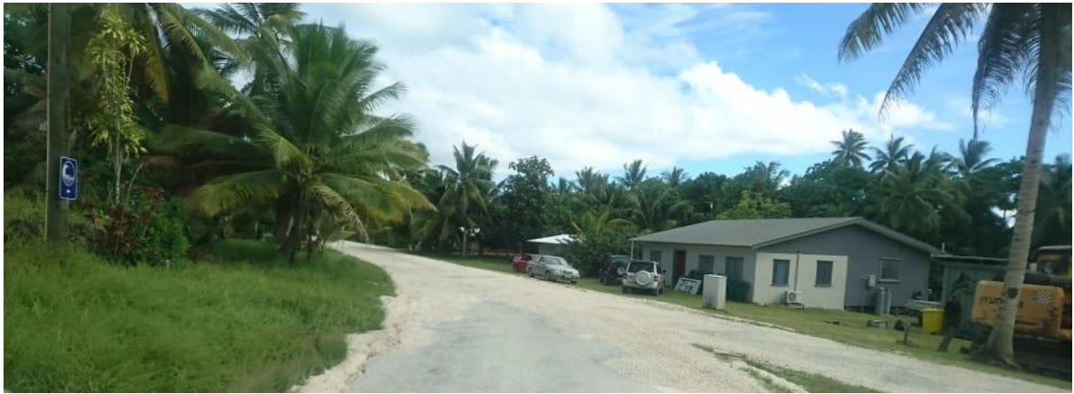
Tamakautoga end of hill