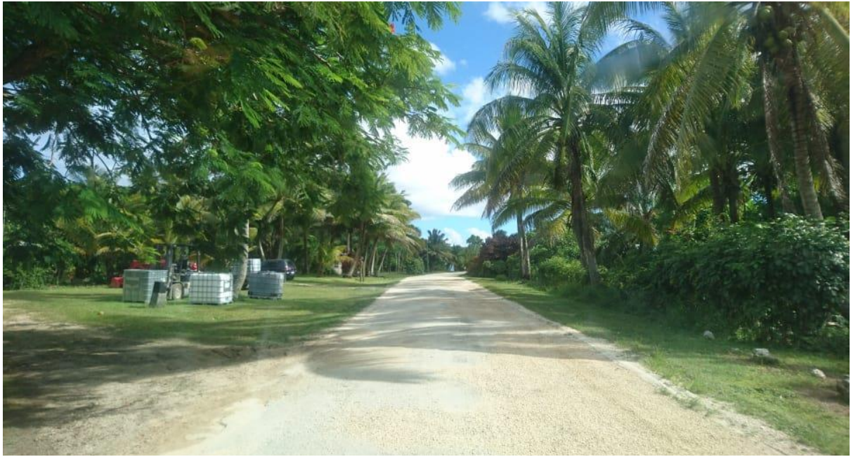
Past Rigamoto residence.