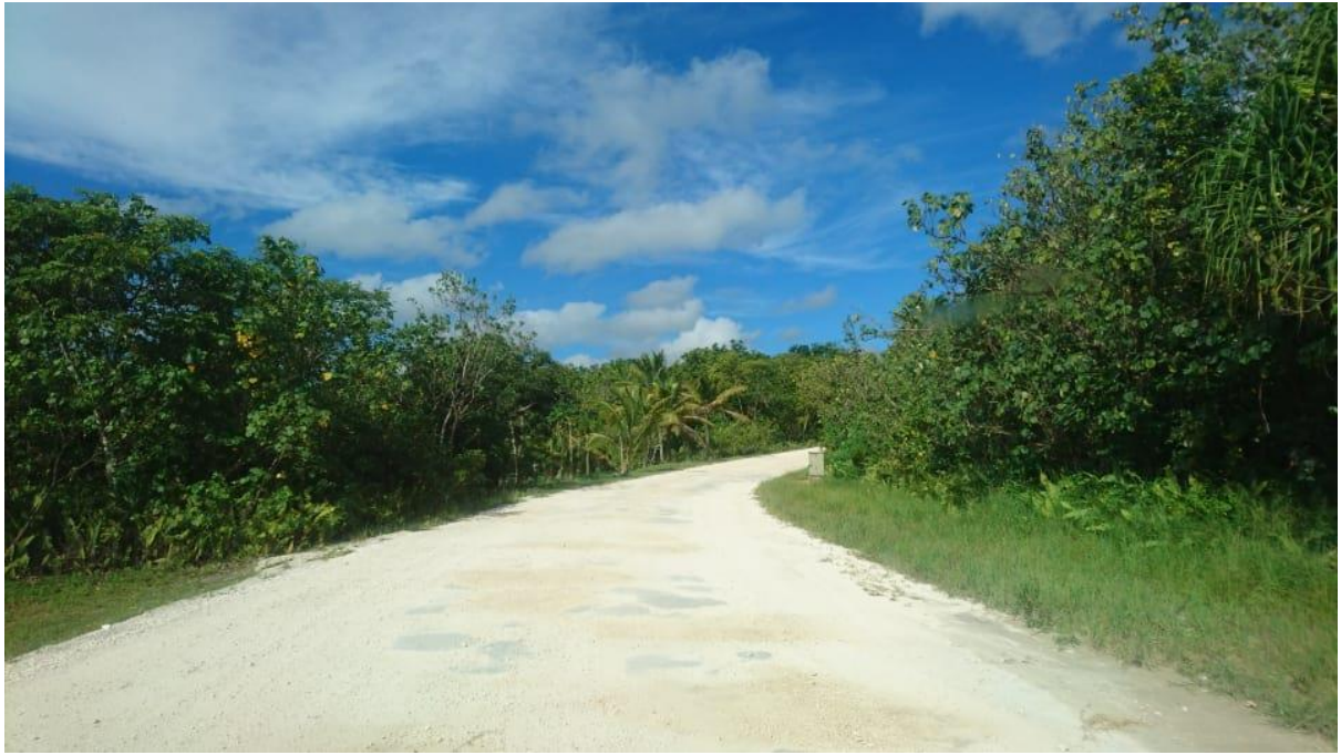
Ontop of Avatele hill.