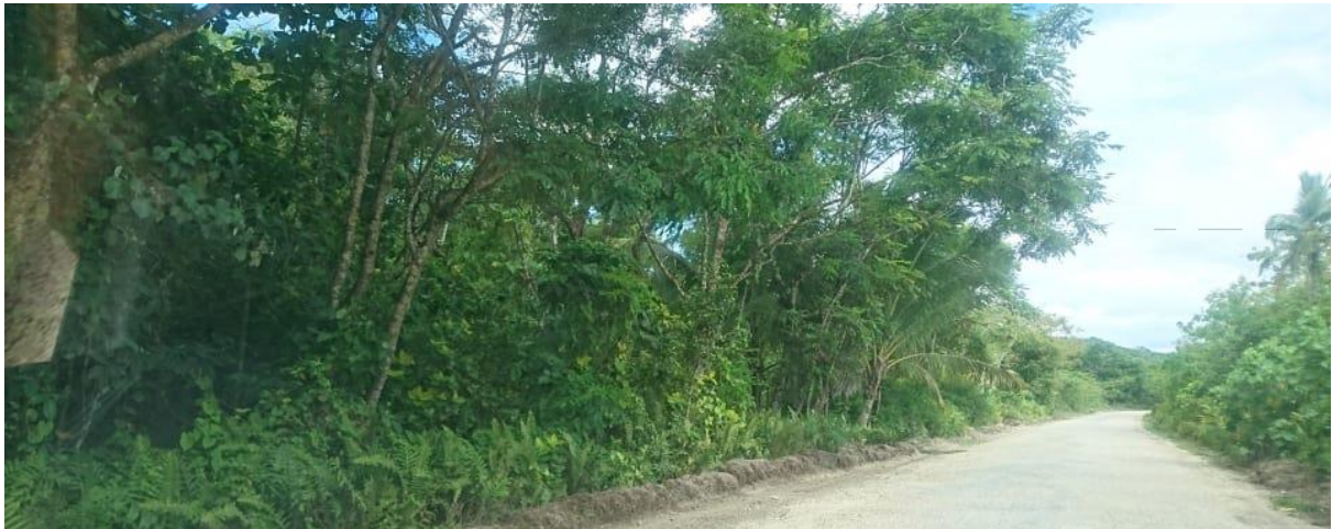
Bend before Pofitu