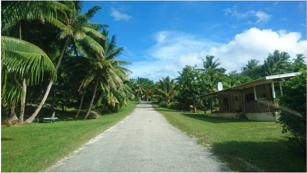
Going uphill in Avatele