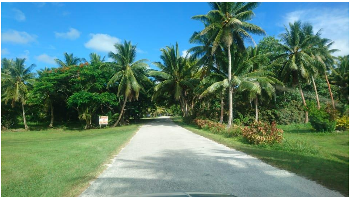
Going past old village school Liolau