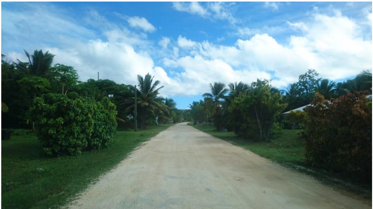
Avatele main road