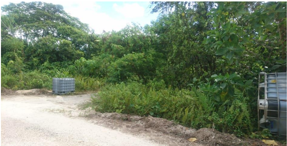
Past matavai, tipped IBC to indicate that they have been used.