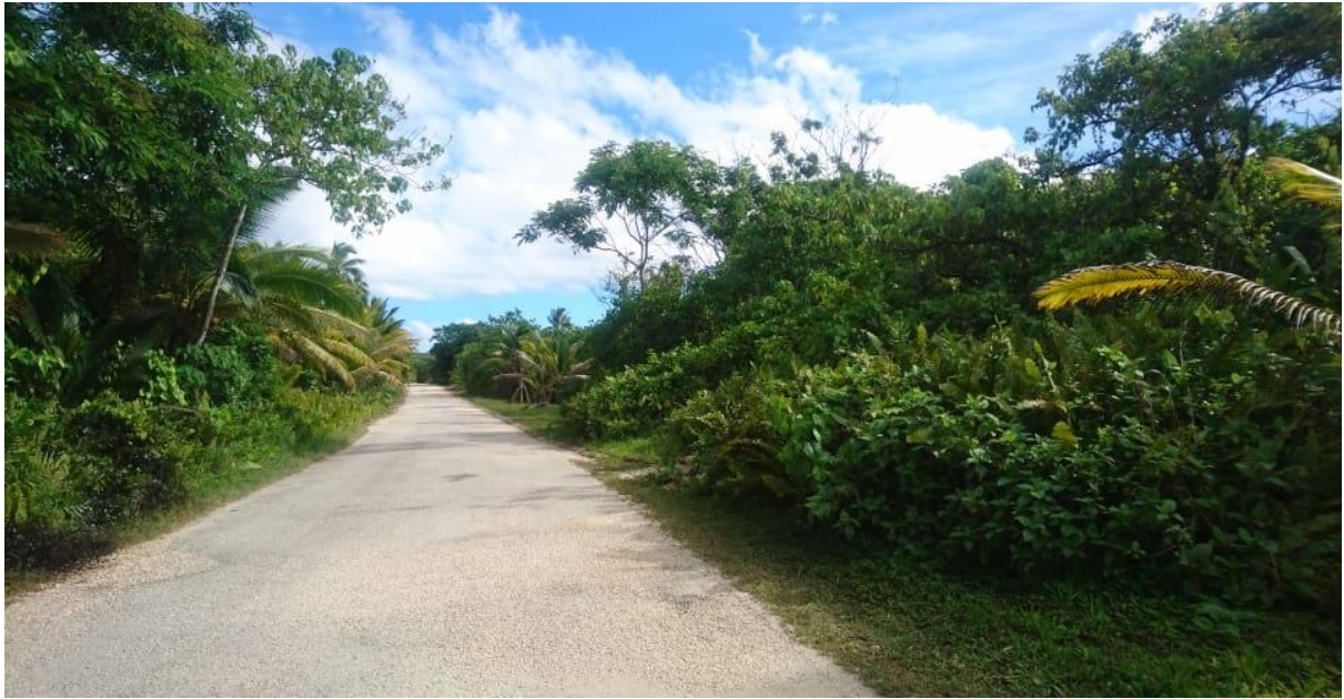
Just before avatele