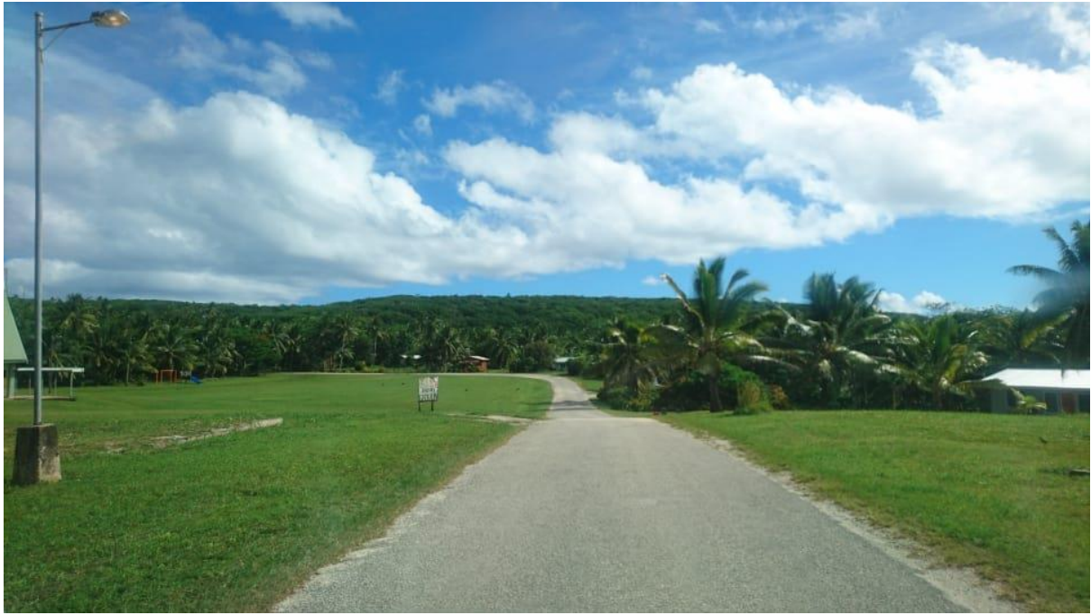
Avatele Church road