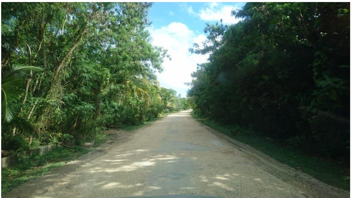
Road on the way to main road in Avatele village